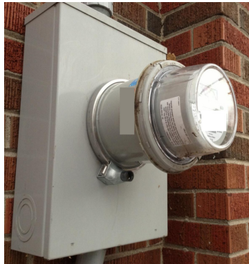
Photo B1 - External Load Limiter

External Load limiters (see photo B1) or meters containing integral contacts for remote disconnection and reconnection of service and/or load limiting capability are considered arc producing and shall be kept outside of the 1 m radius shown in Figure B1. Many utilities reserve the right to install other types of meters or devices, which may contain arcing components, without notice. When questions arise if a utility’s meter or load limiting device can be located within 1 metre of the discharge vent, the utility shall be consulted. Meter mounting device (Meterbase) locations, as per rule 6-408(f), shall be in compliance with the requirements of the supply authority.