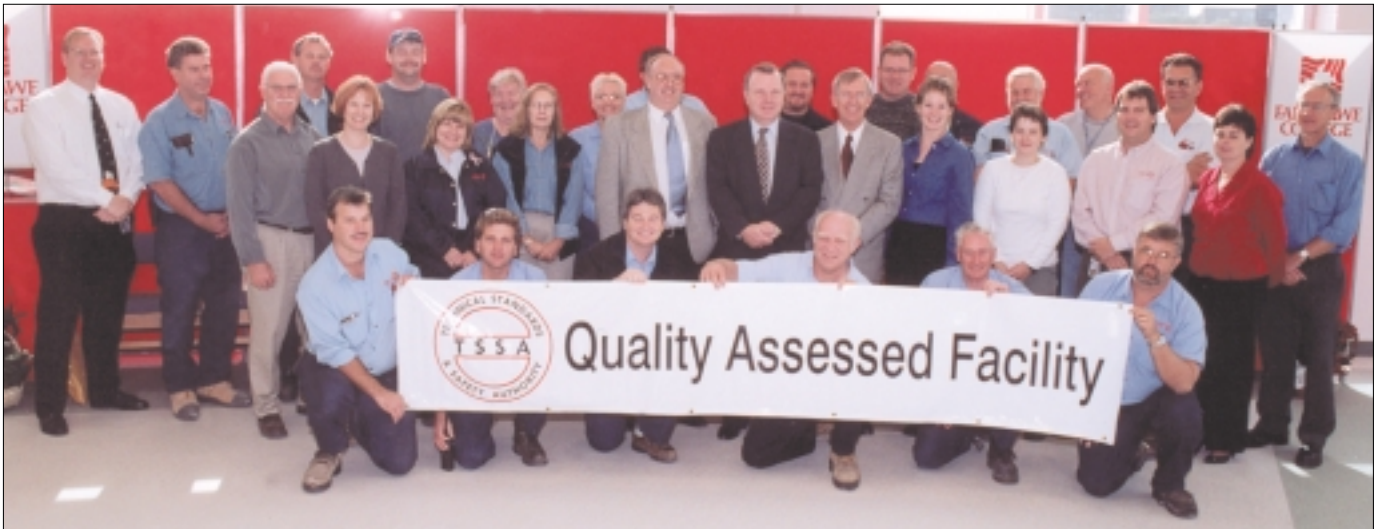
Campus Living staff pose with their new "Quality Assessed" banner presented by TSSA at a ceremony held at Fanshawe College.

TSSA's Facility Quality Assessment program is a voluntary program designed to assist industrial and commercial facilities comply with the various public safety statutes that TSSA administers.